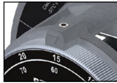
Dial locking screw